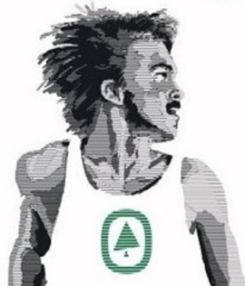
PRE'S TRAIL REVIVAL RUN OREGON TRACK CLUB EUGENE, OR

The Oregon Track Club is hosting the Pre's Trail Run on May 26 in Alton Baker Park. This memorial event was first held in 1975, a few months after Steve Prefontaine's death. The run was not held for several years until the OTC decided to bring back the popular event last year.